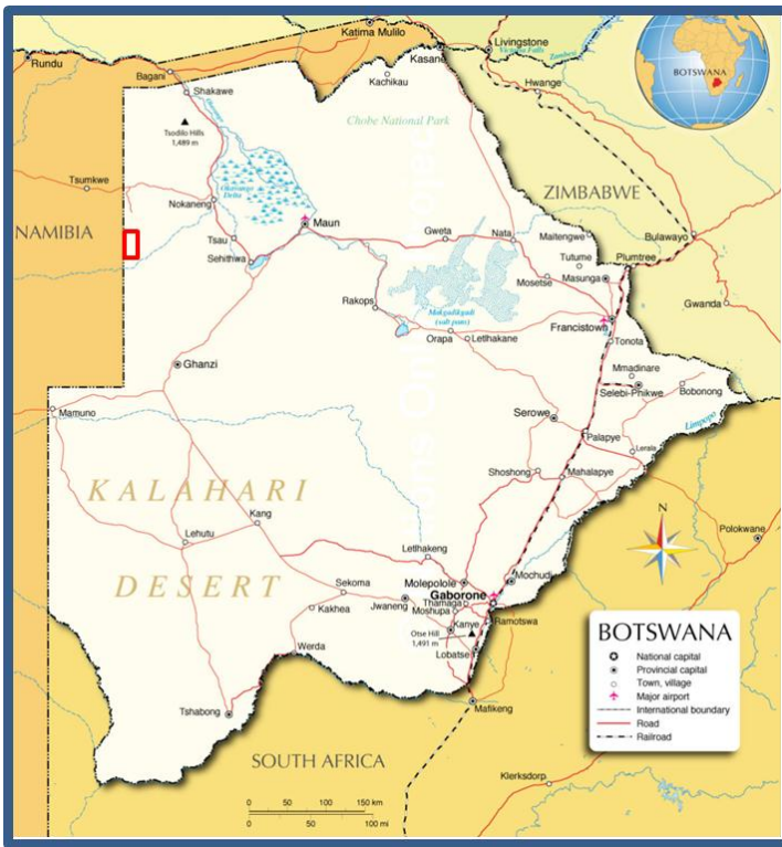
Figure 2: The Kihabe Project (red box) covers 997km 2 and is located in Botswana near the Namibian Border and border crossing of Dobe. The nearest railhead is 337km west. There is a landing strip on the licence area and an international airport at Maun ~250km east. There is an established camp on the licence area.